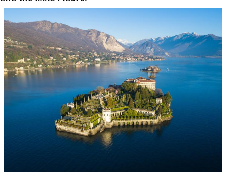
Isola Bella with the Isola dei Pescatori in the background

We will have a buffet lunch at the Ristorante Italia at the northern end of the island, with a view of the lake and the Isola Madre.