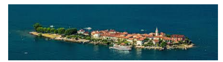
Isola dei Pescatori

The Borromean Islands are a group of islands in the Lage Maggiore. We will be visiting the Isola dei Pescatori (also known as the Isola Superiore) and the Isola Bella (also known as the Isola Inferiore).